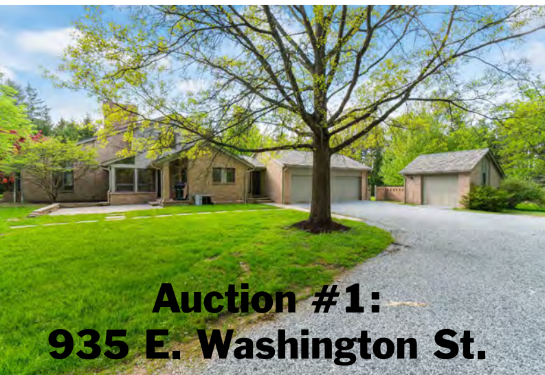
Auction #1: 935 E. Washington St.