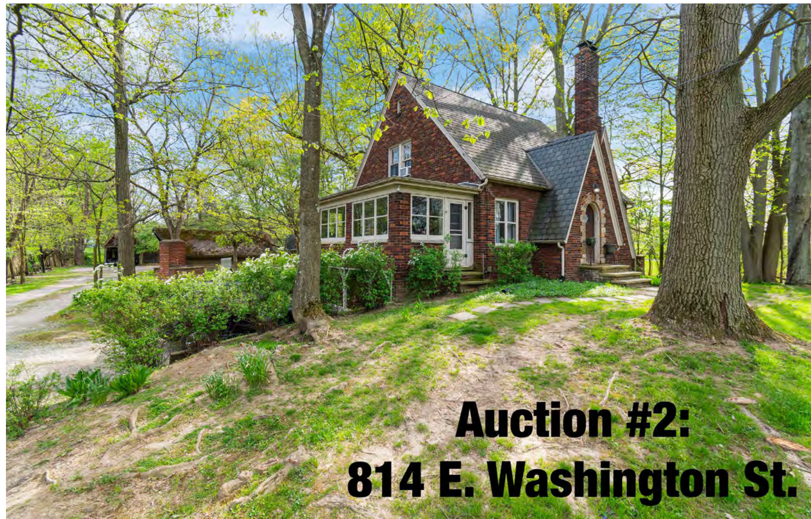
Auction #2: 814 E. Washington St.